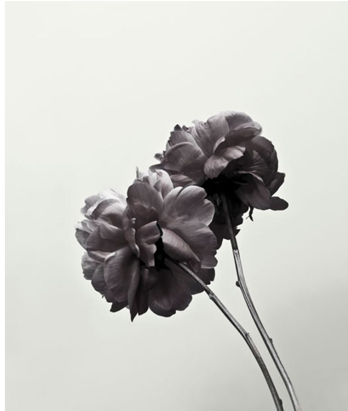
Peony 2163, 2012 Ultra chrome HDR pigment print on 500 gsm cotton paper 24" x 20" $5,500