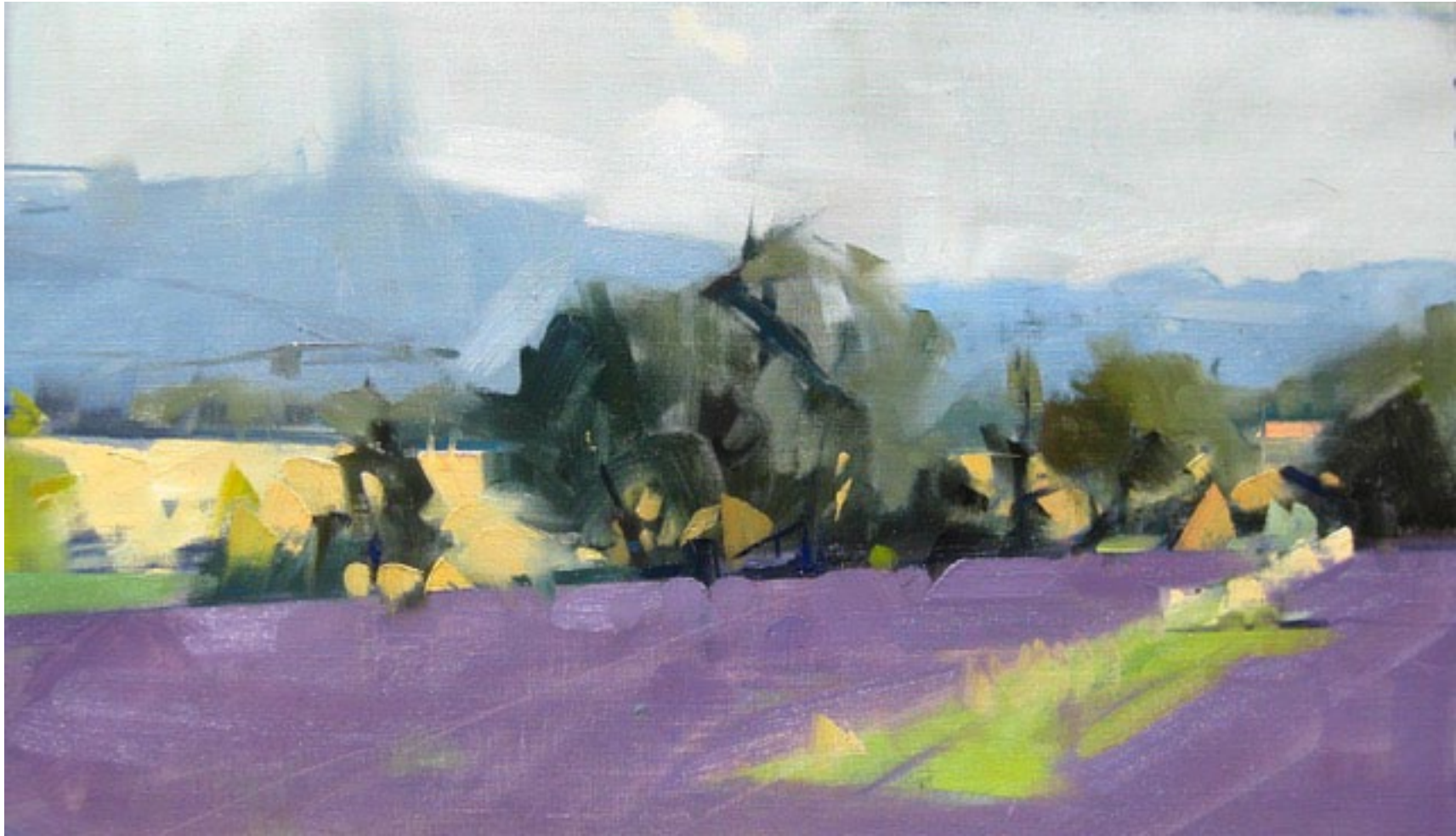
Lavender C , 2018 Oil on linen 12" x 21" $3,500