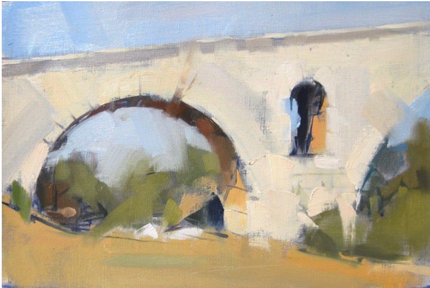
Pont Julian , 2018 Oil on linen 10" x 15" $2,600