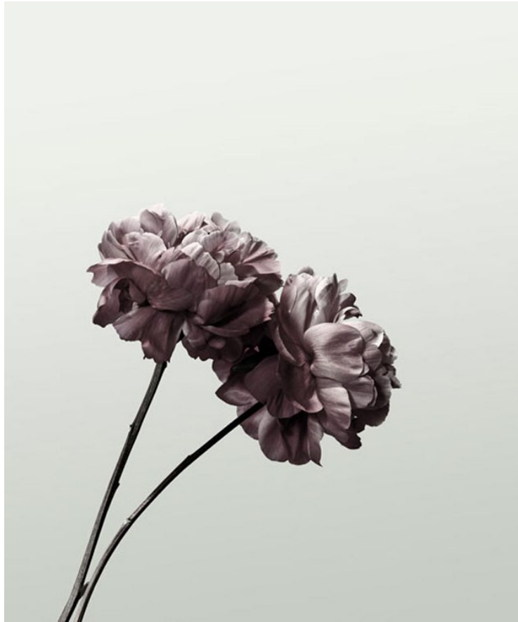
Peony 2169, 2012 Ultra chrome HDR pigment print on 500 gsm cotton paper 24" x 20" $5,500