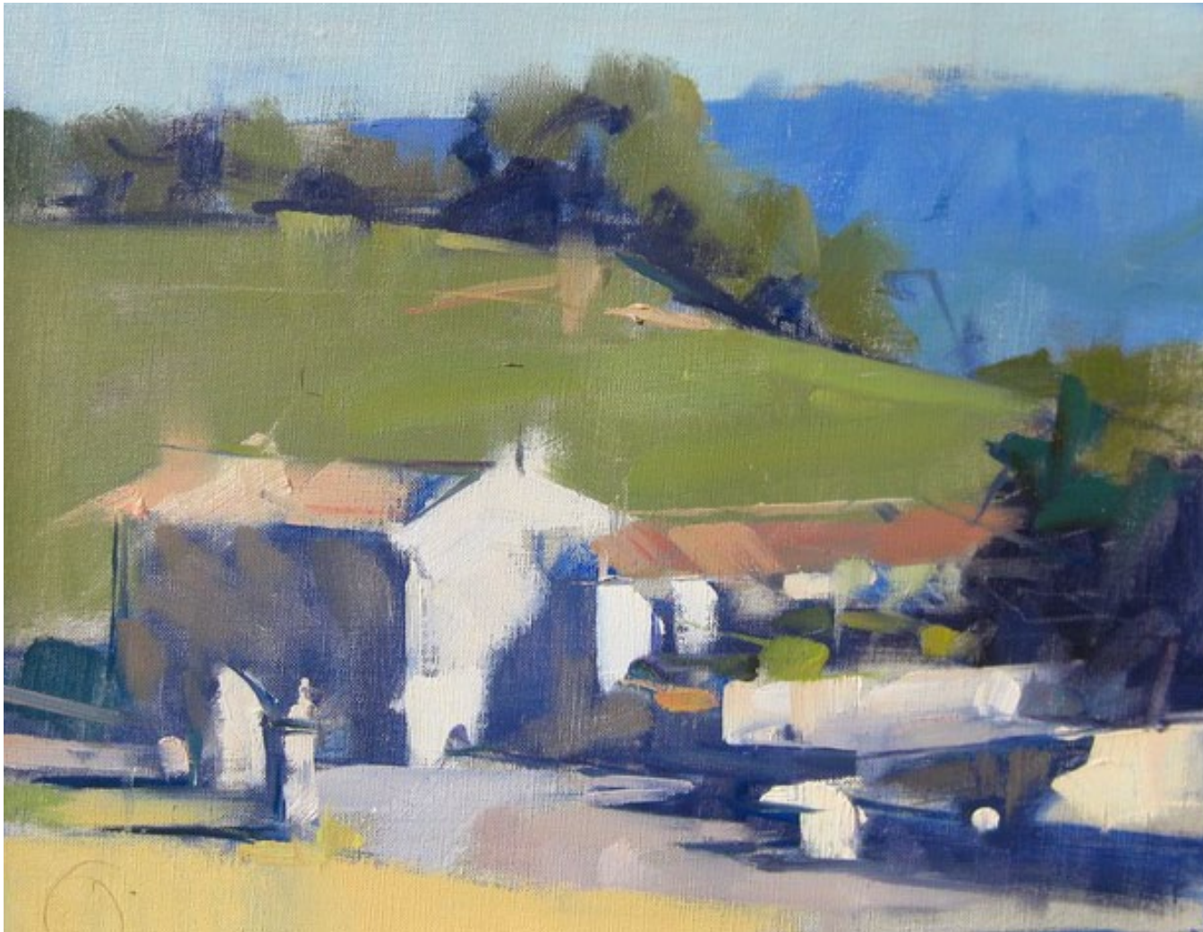
Murs Bridge , 2018 Oil on linen 10" x 13" $2,200