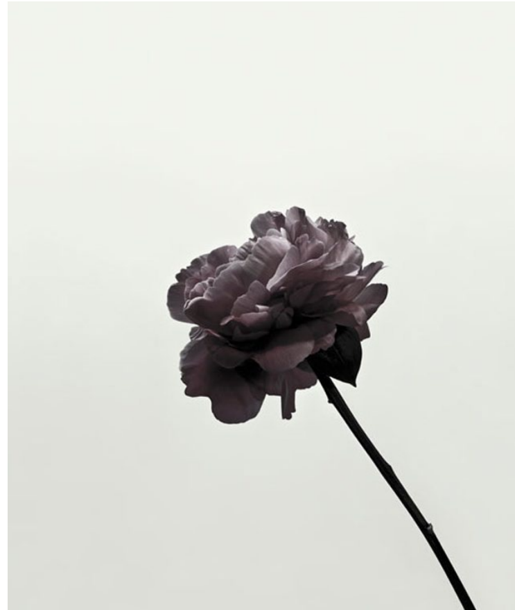
Peony 2022, 2012 Ultra chrome HDR pigment print on 500 gsm cotton paper 24" x 20" $5,500