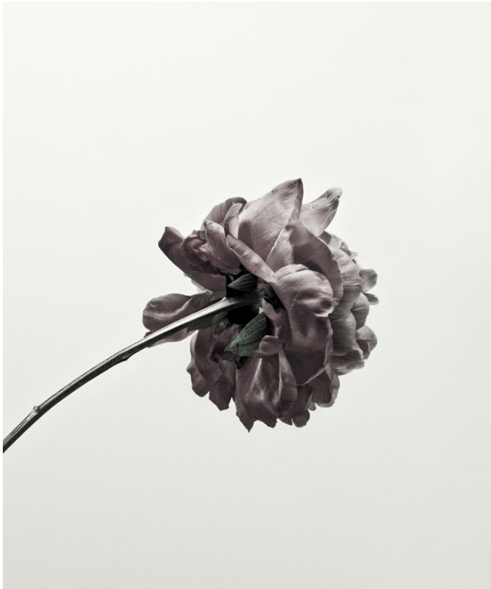
Peony 2033, 2012 Ultra chrome HDR pigment print on 500 gsm cotton paper 24" x 20" $5,500