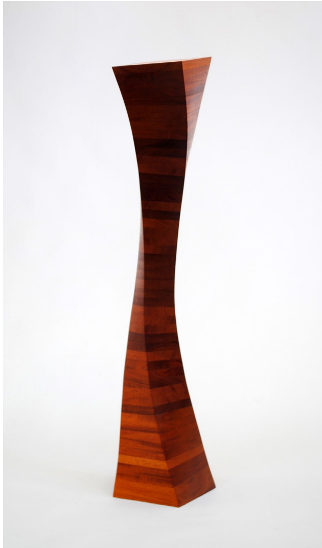
Ascend , 2018 Mahogany sculpture 36" in height $8,000